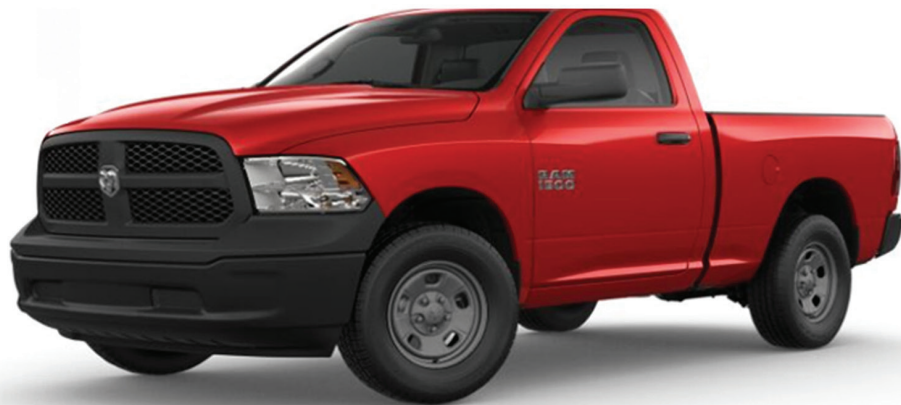
2019 Dodge Ram Truck