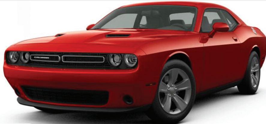
2019 Dodge Challenger