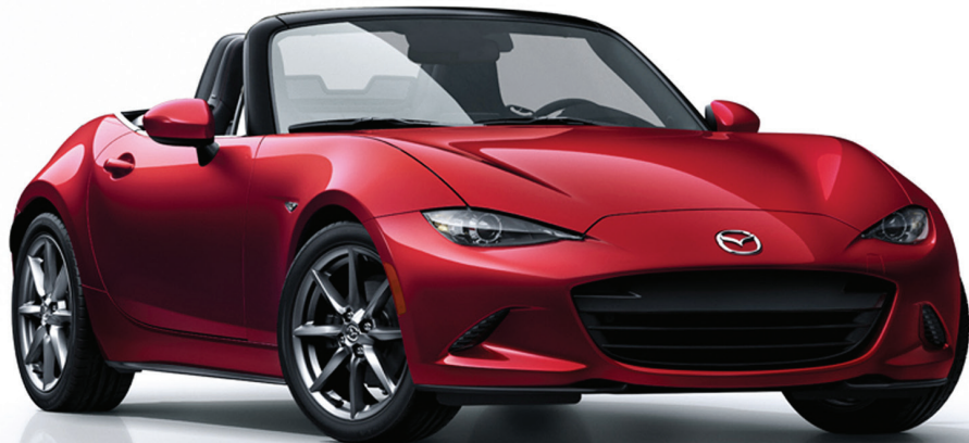
2019 Mazda Miata Convertible