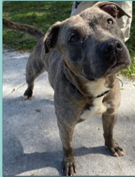
MAGNI 5 year old Male Mixed Breed

Hi there! My name is Magni and I'm just a handsome guy looking for his new home! Some of my favorite things to do are playing outside with my other doggy friends, and chase the dragonflies! My friends here at the shelter all tell me I'm just a cute guy, and they don't know why I haven't been adopted yet! All I know is, if you're looking for a nice dog to add to the family who loves cookies, and can enjoy the simple things...I'm your man!! Come meet me at the Animal Care Center! You'll be glad you did! I am microchipped, up to date on vaccines, and my adoption fee is sponsored!