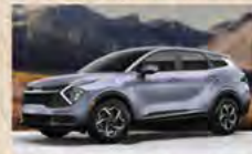
For the Upscale Adventure ... 2024 Kia Sportage

1 ticket for $25 / 5 tickets for $100 Donation Grand Drawing - 2pm-5pm - Sunday October 27 th 2024 at the American Muscle Car Museum