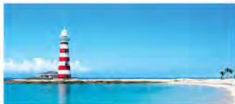
Your Own Private Island MSC Ocean Cay Marine Reserve

Sail with your friends - and your whole family! Meet your Helping Seniors friends from Brevard County on the luxurious MSC Seashore! Start your 2025 with a 3-night, 7-night or 10-night sailing to visit Ocean Cay Marine Preserve, the MSC Private Island Reserve, and more!