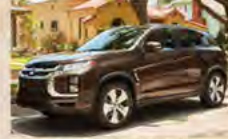
For the Stylish Adventure... 2024 Mitsubishi Outlander