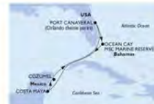
7-Night West Caribbean Feb 2 - Feb 9 2025