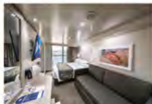
Balcony Stateroom MSC Seashore