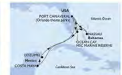
10-Night Bahamas/Mexico Jan 30 - Feb 9 2025