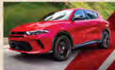
For the Racing Adventure ... 2024 Dodge Hornet