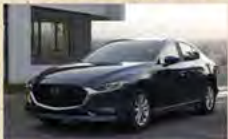
For the Elegant Adventure... 2024 Mazda3 Sedan