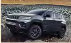
For the Exploring Adventure... 2024 Jeep Compass Sport