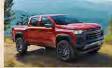
For the Hauling Adventure... 2024 Chevrolet Colorado