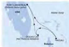
3-Night Bahamas Jan 30 - Feb 2 2025