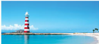
Your Own Private Island MSC Ocean Cay Marine Reserve

Sail with your friends - and your whole family! Meet your Helping Seniors friends from Brevard County on the luxurious MSC Seashore! Start your 2025 with a 3-night, 7-night or 10-night sailing to visit Ocean Cay Marine Preserve, the MSC Private Island Reserve, and more!