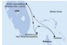
3-Night Bahamas Jan 30 - Feb 2 2025