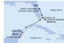
7-Night West Caribbean Feb 2 - Feb 9 2025