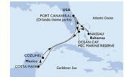
10-Night Bahamas/Mexico Jan 30 - Feb 9 2025