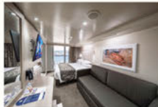
Balcony Stateroom MSC Seashore