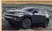
For the Exploring Adventure... 2024 Jeep Compass Sport