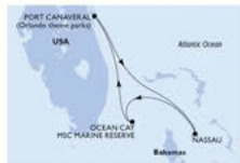
3-Night Bahamas Jan 30 - Feb 2 2025