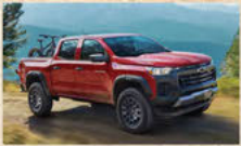
For the Hauling Adventure... 2024 Chevrolet Colorado