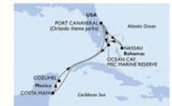
10-Night Bahamas/Mexico Jan 30 - Feb 9 2025