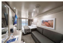
Balcony Stateroom MSC Seashore