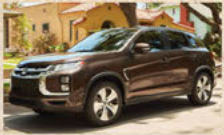
For the Stylish Adventure... 2024 Mitsubishi Outlander