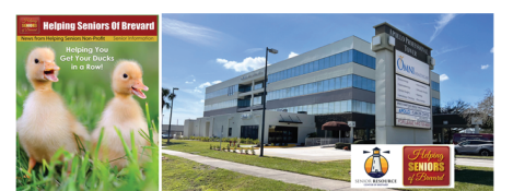
The Helping Seniors Resource Center 2nd floor of the Omni Medical building 1344 S Apollo Blvd - Melbourne FL

Learn more about Helping Seniors at HelpingSeniorsofBrevard.org