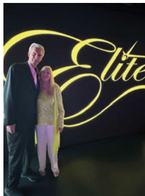
Accepting award for One Of The Top Agencies In The US

Thanks to all of our senior clients for making Senior Travel / The Travel Center the #1 agency in Brevard