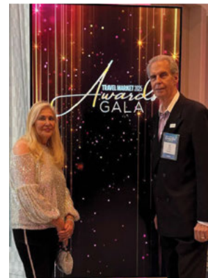
At the Top Agency Awards Celebration

Thanks to all of our senior clients for making Senior Travel / The Travel Center the #1 agency in Brevard