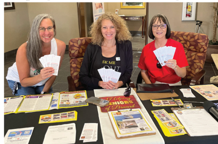
Don't forget Helping Seniors Car Tix HelpingSeniorsCarRaffle.com