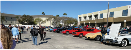
Car Show at Helping Seniors!

10am-2pm Saturday June 27th at the Senior Resource Center